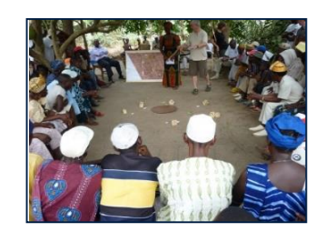
2. Stakeholder Engagement

Recognises the importance of stakeholder engagement , as a means to ensure respect for the rights to: (i) access to information; (ii) public participation in decision-making processes; and (iii) access to justice;